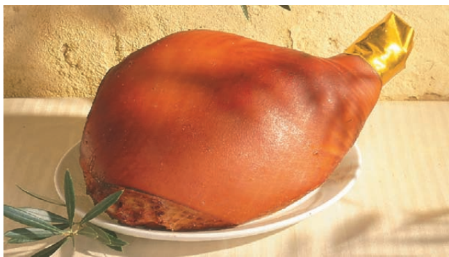
9669. Cooked Leg Ham on the Bone - full Approx. 10kg.