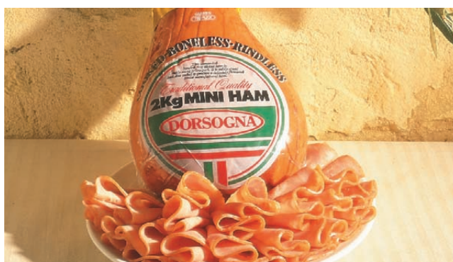
9872. Boneless Mini Ham 2kg.

Extremely lean-cut, the Ham Royale is a full muscle premium leg ham in an economy size. It has been traditionally wood smoked to enhance its natural flavours.