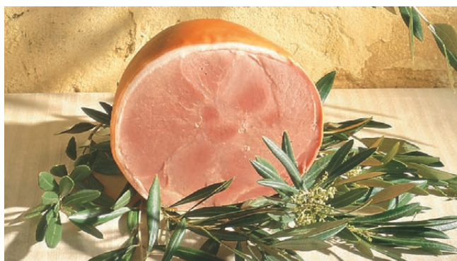
9780. Premium Boneless Leg Ham - full Approx. 7kg.

This premium ham is made from the finest lean pork, cured then wood smoked. It has a lightly spiced, delicate flavour. The ham is partly boned to make slicing and preparation easier.