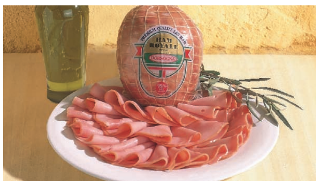
9786. Ham Royale Approx. 850g.

This premium quality boneless ham is cured and wood smoked to a traditional D'Orsogna family recipe. It has a unique, delicate flavour and very fine texture.