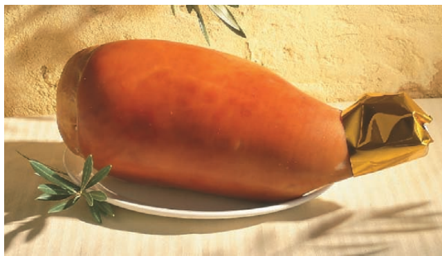
9865. Champagne Ham on the Bone Approx. 9kg.

This premium ham is the cured and smoked selected lean hind leg of pork. This traditional Christmas leg ham is cooked, lightly spiced and wood smoked to enhance its delicate flavours.