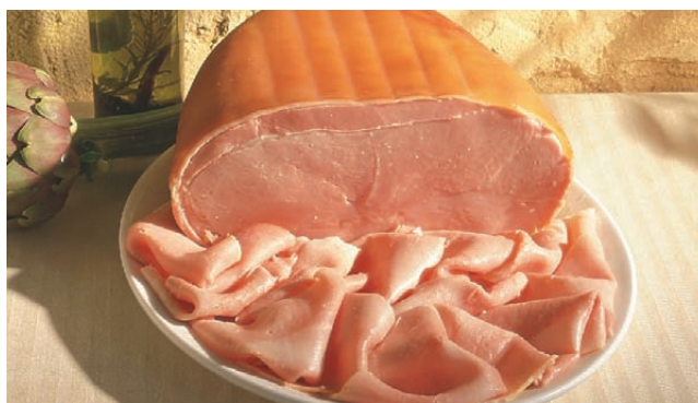
9863. Boneless Virginia Ham Approx. 4kg.

This premium ham is made from the finest cured and smoked hind leg of pork. It is cooked to a traditional D'Orsogna family recipe resulting in an unusually delicate flavour and texture.